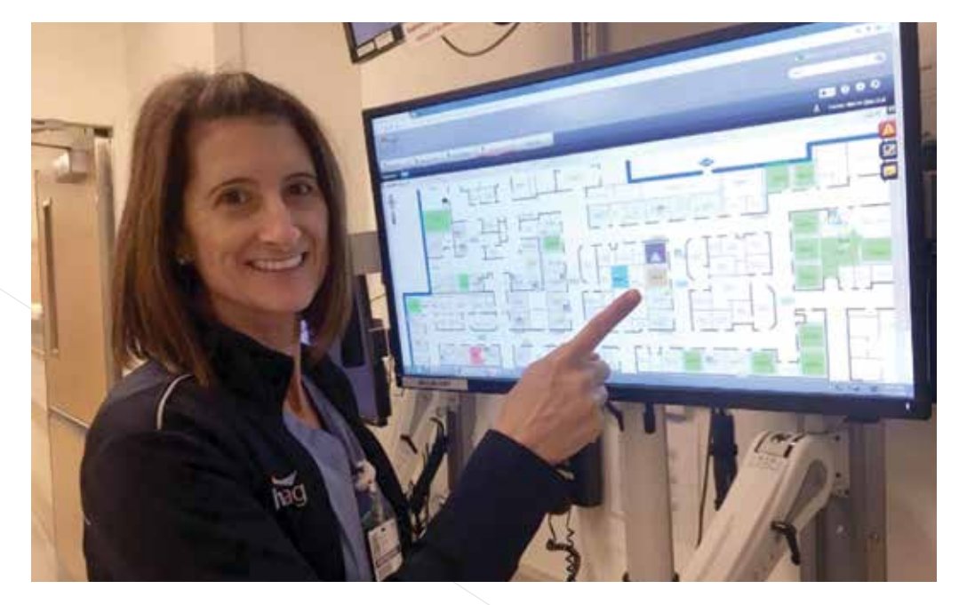
Emergency Department nurse using the RTLS map in the Fimiano Emergency Pavilion

The upgrades included new equipment such as badges (that act as trackers), monitors in various rooms and new system-designated computers.